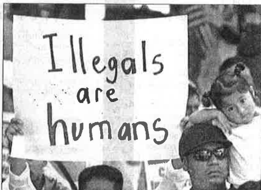
CONTINUED ON PAGE 19