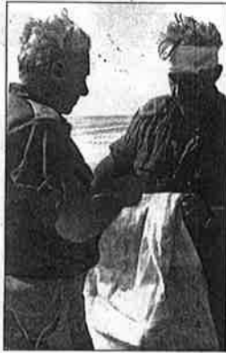
Maj. Gen. Ariel Sharon, right, views a map together with Maj. Gen. Haim Bar-Lev in the Sinai desert, during the Middle East war on Oct. 10, 1973.

it is no secret that there were times the United States had differences with him. But whether you agreed or disagreed with his positions — and Arik was always crystal clear about where he stood — you admired the man who was determined to ensure the security and survival of the Jewish State," Kerry said in a statement.