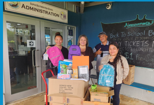
Saipan Southern High School - School Supplies (October)