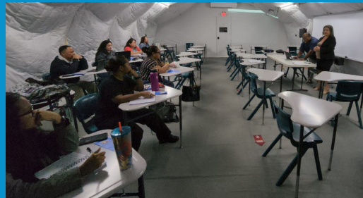
University of Guam Masters in Policies Admin. Cohort (October)