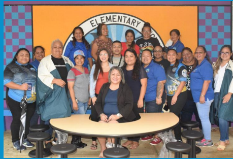
Kagman Elementary School - Horseshoe Tables & Wobble Chairs (October)