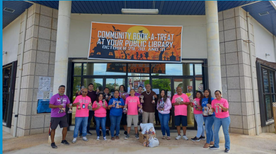
JKPL Book A Treat 2021